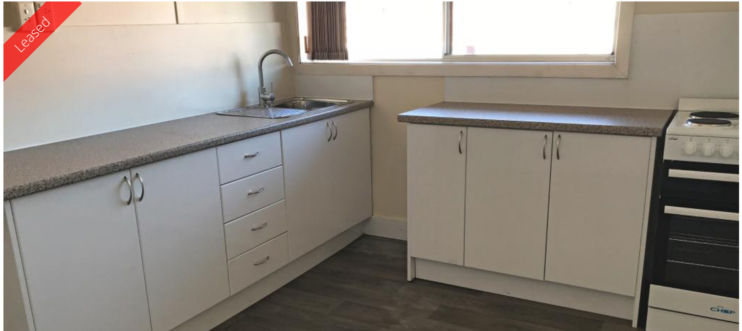
Unit 4, 61 Church St, Gloucester