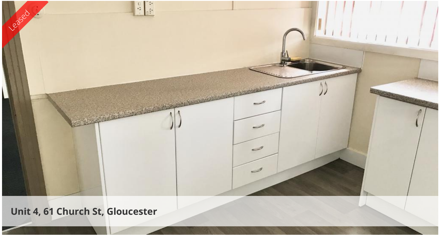
Unit 4, 61 Church St, Gloucester