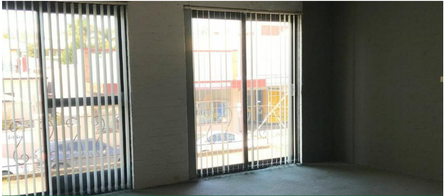
Unit 3, 33 Church St, Gloucester