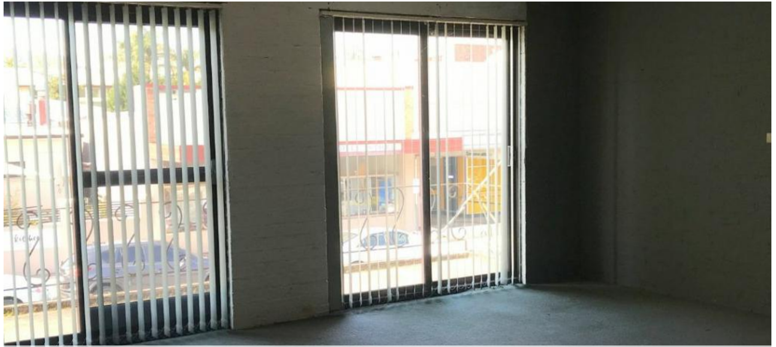
Unit 3, 33 Church St, Gloucester