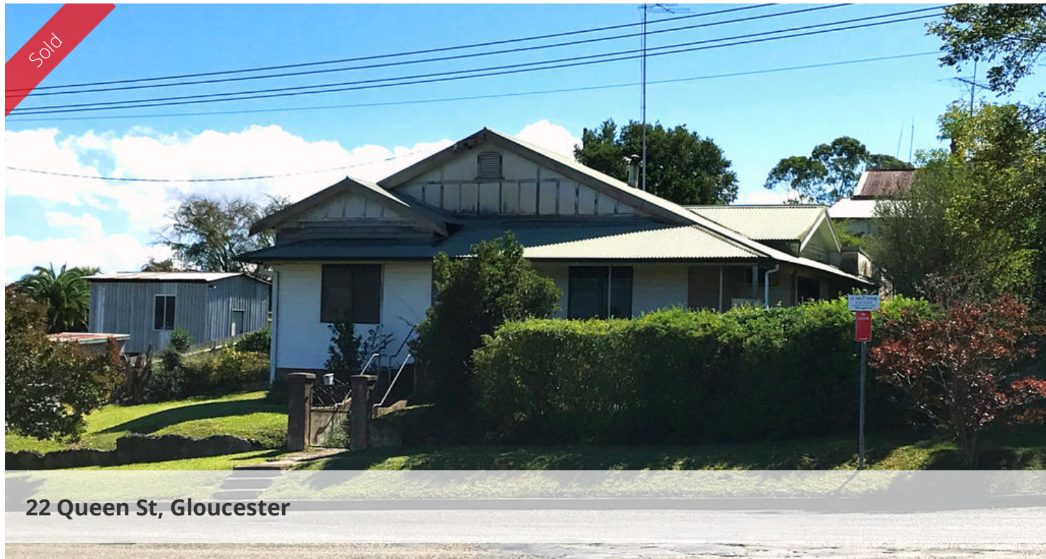
22 Queen St, Gloucester